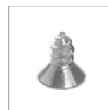
A39110.LPE213 Vis screw