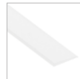
A39110.OPL Diffusor opal