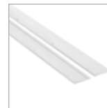
A39110.00 Prof I