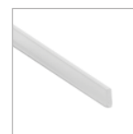
A39126.OPL Diffusor opal