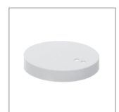
A39172.LP226 Plastic endcap