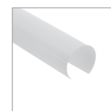
A39172.LPE01.I4 Opal Polycarbonat