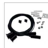
A39172.KC010 Suspension kit Silver/white/black