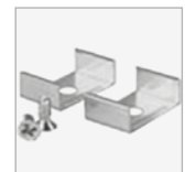
A3960.CLI Clips Inox