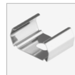
A3960.CLS Clips Inox Strong