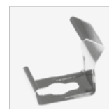
A3960.C45 Clips 45°