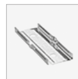
A3960.CLI Clips liaison